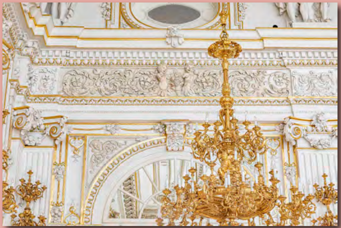
▶ 1.6 Prague Castle, Spanish Hall, temporarily opened original space of the niche, 1604–1611, from mid 19th century covered by mirror, Prague Castle collection, restoration report 1990