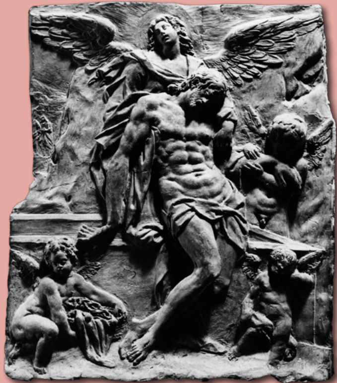
▲▲ 1.1 Bartholomeus Spranger, The Body of Christ Supported by Angels, oil on copperplate, 33.7 × 26.6 cm, Rijksmuseum Amsterdam